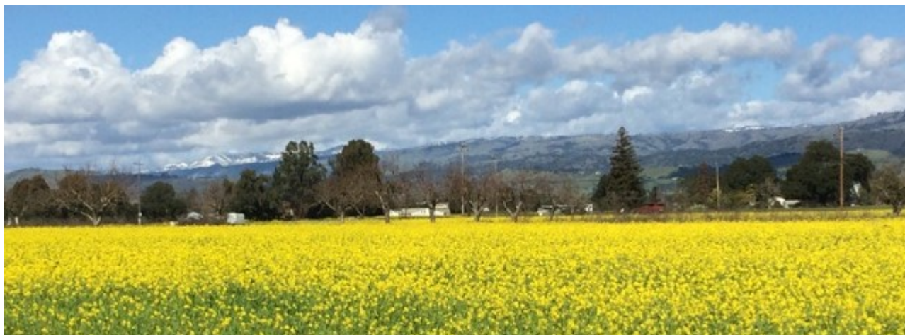
Wildflowers of Morgan Hill—a field of mustard (also known as rapeseed)

Thank you for supporting education and equity for women and girls.