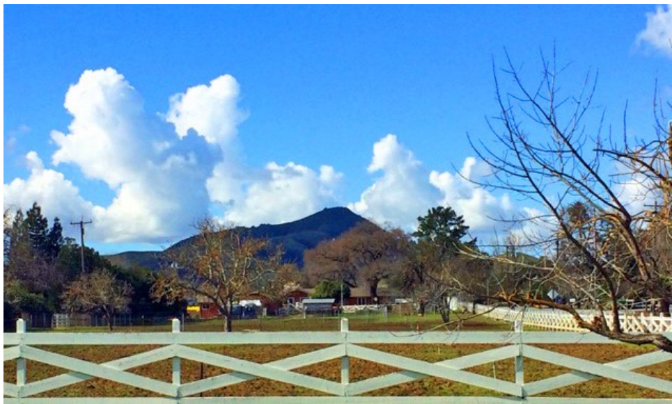
Clouds above El Toro.